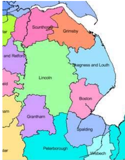
Travel to Work Area (TTWA's) in Greater Lincolnshire