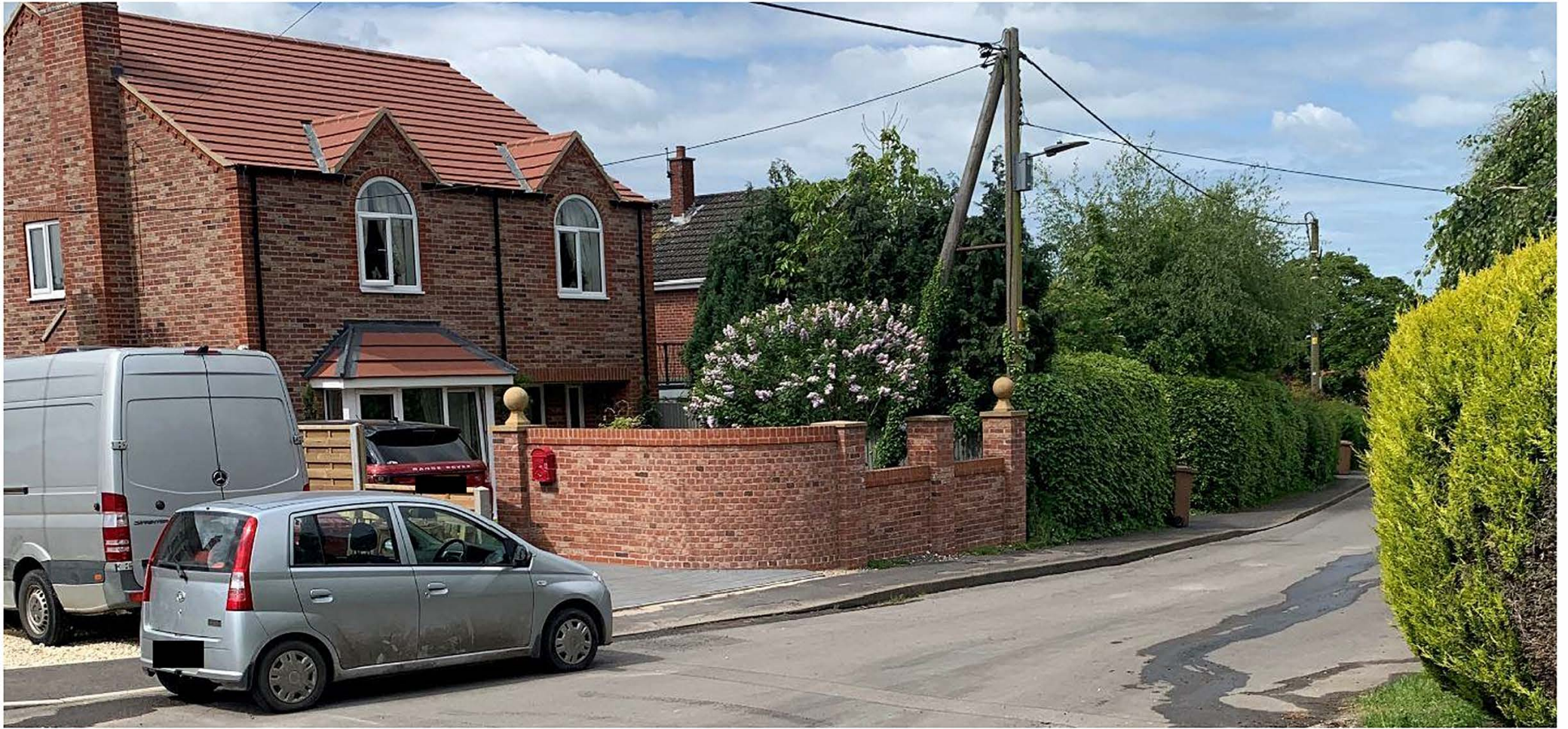
PA/2023/67 Photograph of wall in situ