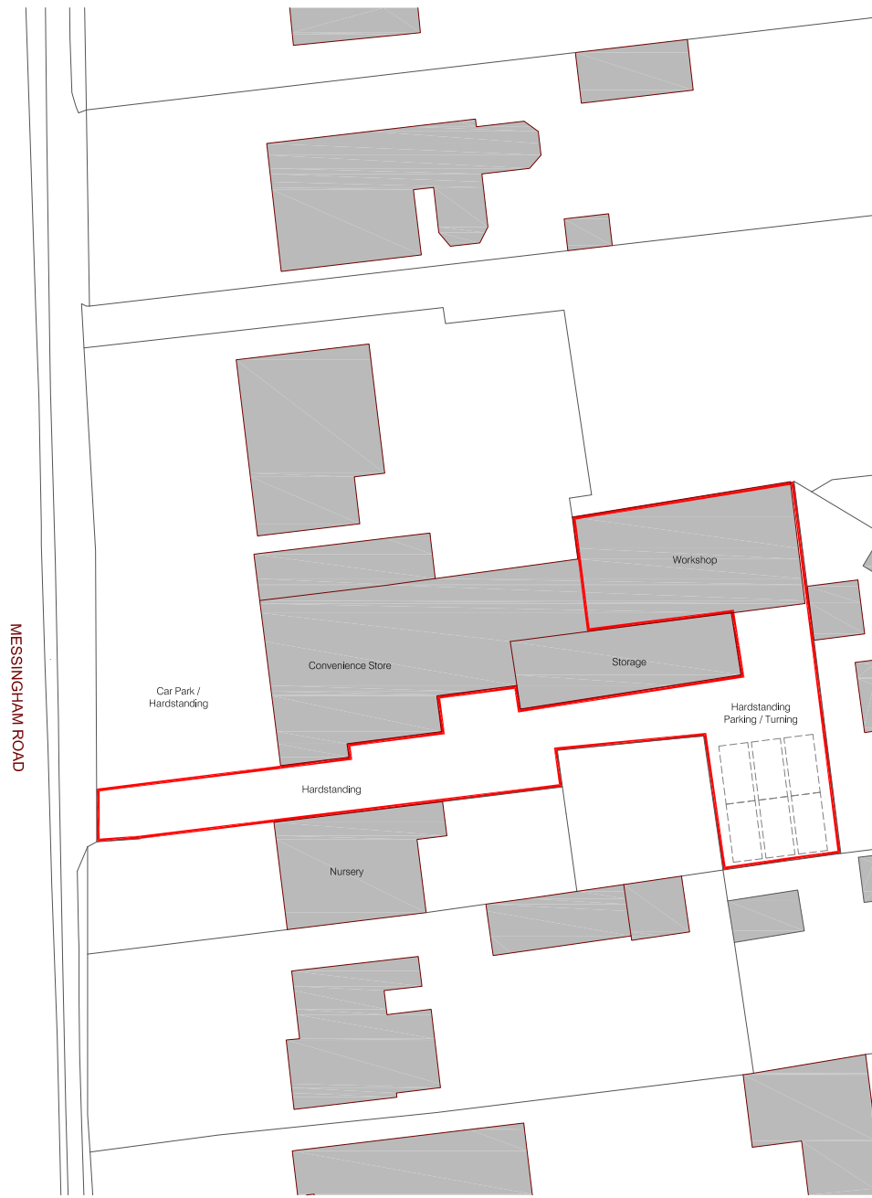
Site Plan scale 1:200